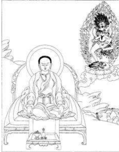
Marpa (foreground) and Two-Armed Hevajra (background).

Traditionally there are twelve types of teaching styles proper to a Buddha. The sutras can be divided into twelve categories according to which of the twelve styles the Buddha has employed in it. One of the twelve styles is that of creating a situation in which the teaching can transpire. Take the example of the Prajnaparamita-hridaya or Heart Sutra . In the original Sanskrit version of this sutra, Buddha does not say a word; but it was Buddha who created the dialogue between Avalokiteshvara and Shariputra. Buddha created the situation in which Shariputra could act as the receiver or audience and Avalokiteshvara as the propounder of the analysis.