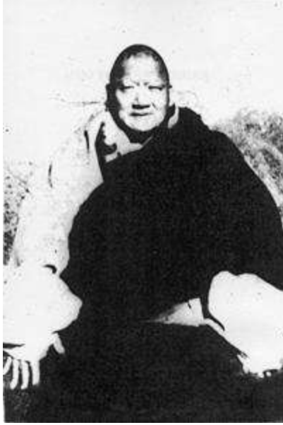
Padma Tri-me, Jamgön Kongtrül of Sechen (1901?–1960). The root guru of Chögyam Trungpa and an incarnation of Lodrö Thaye, Jamgön Kongtrül I.