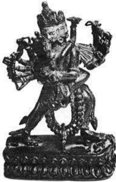
Chakrasamvara and Vajravarahi. Two of the principal yidams, or “personal deities,” of the Kagyü school of Tibetan Buddhism, used in tantric visualization practice. This statue was a shrine object of Naropa, Marpa’s guru.