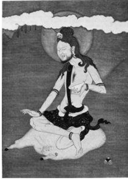
Naropa. PAINTING BY GLEN EDDY.