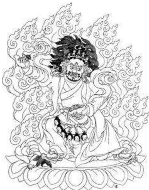
Mgon-Po-Legs-Ldan (the "Grandfather" Mahakala).