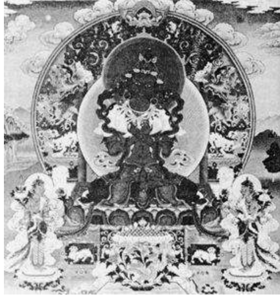
Vajradhara. The dharmakaya buddha. A tantric manifestation of the Buddha, Vajradhara is depicted as dark blue.

PAINTING BY SHERAPALDEN BERU.