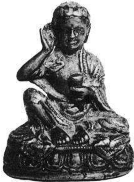
Jetsün Milarepa (1040–1123). The chief disciple of Marpa, Milarepa is renowned for his songs of devotion and realization. This statue was a shrine object of Gampopa, Milarepa's chief disciple.

That strategy is used to take advantage of the sanity of human beings—which is unlawful.