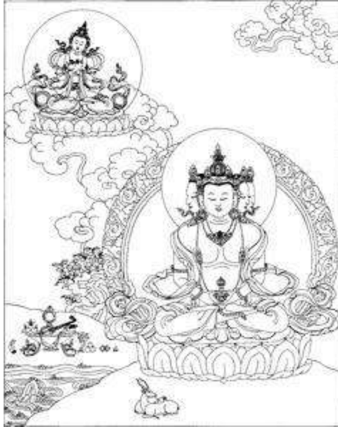
Mahavairochana (foreground) and Vajradhara (background). DRAWING BY TERRIS TEMPLE.