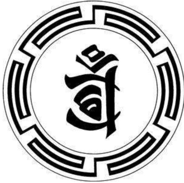
EVAM. The personal seal of Chögyam Trungpa and the Trungpa tulkus (see chapter 14). DESIGN BY MOLLY K. NUDELL.