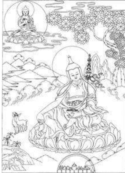
Padmasambhava (foreground) and dGa'-Rab-rDorje (background).

Let us apply ourselves to an understanding of tantra as it developed in the Buddhist tradition. A term that has been used from the beginning in close association with the term tantra is the Sanskrit prabandha . Prabandha means continuity. This is a continuity of being, which divides into two grounds: we have to start somewhere, and then go a certain way (and perhaps arrive at a goal). This is the way tantra was presented. It refers to an immediate human situation which arises out of the question of how we are going to be . Tantra also sees the question of how we are going to be in terms of relationship, realizing that man is always related to something or someone.