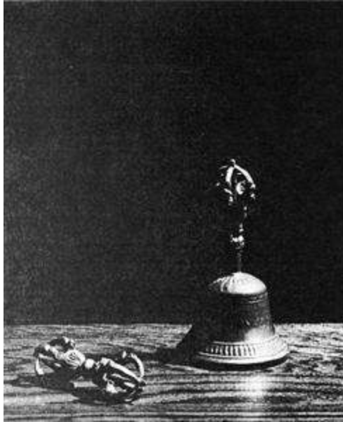
Vajra and ghanta (bell).

The buddha family, or families, associated with a person describes his or her fundamental style, that person's intrinsic perspective or stance in perceiving the world and working with it. Each family is associated with both a neurotic and an enlightened style. The neurotic expression of any buddha family can be transmuted into its wisdom or enlightened aspect. As well as describing people's styles, the buddha families are also associated with colors, elements, landscapes, directions, seasons—with any aspect of the phenomenal world.