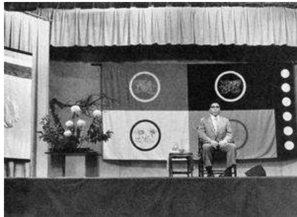
Chögyam Trungpa teaching a dharma art program in Boulder, Colorado. Behind him can be seen his personal flag or standard. To his right is the Shambhala flag. From top to bottom, the four stripes on the Shambhala flag are orange, white, red, and blue.

sense of how to rule the world and how to perceive the world at the same time. The heritage and benevolence of the Mukpo clan are my gift to you. Decency is the heritage of the Mukpos. In the past, the Mukpo clan tried to be decent, and we achieved decency altogether. Why not pass that decency down to you and the generations to come?