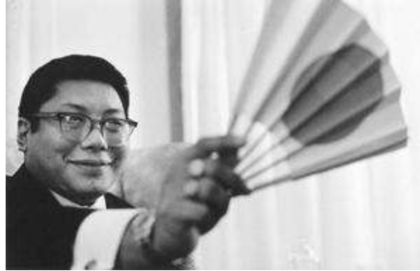
Chögyam Trungpa.

Who are they? Where are they? That's the dot in space! 1 Inquisitiveness is the dot in space. Curiosity is the dot in space. Any question that comes into your state of being is the dot in space, always. One should not regard one's world as a boring world. There is always Ah-ah! There is always a spark. There is always a smile. There is always a cry, as well. That is the dot in space. That is why you are here, all of you.