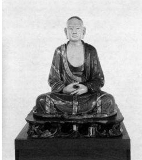
A statue of a lohan, or disciple of the Buddha, in the posture of meditation.

The goal of the Shambhala teachings is to uplift human conditions. Ever since the creation of the notion of a republic and the creation of the notion of individualism, leadership has gone downhill. Our leaders—kings and queens, presidents and prime ministers—have failed us. Let us have a new king, a good queen, a good prime minister. Let us have good head and shoulders. Let us eat properly at our dining room tables; let us drink properly; and let us not overindulge. The rich are the worst offenders in this part of the world, because they can afford to drink from sunrise to sunset, but at the end of it all, they still go downhill, with no notion of human dignity, no notion of daring, no notion of goodness at all. I suppose we could call that some kind of magic bad joke.