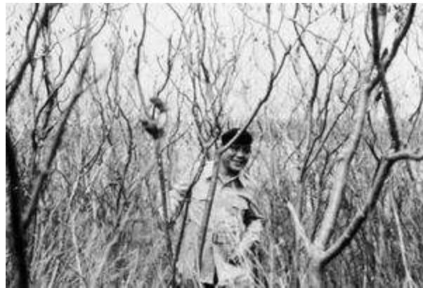
Chögyam Trungpa in a field behind the Balmoral Inn in Tatamagouche, Nova Scotia, 1979.

This book was edited in Nova Scotia, the last place that the Dorje Dradül called home. Most of the work on the book was done in retreat in a little house grandly named Trident Mountain House on Tatamagouche Mountain in the autumn of 1997 and the spring of 1998. During one of his early visits to Nova Scotia, the Dorje Dradül passed through the town of Tatamagouche and stopped for a meal at the Balmoral Inn. After lunch, all of us in his party went for a walk in a field behind the restaurant that slopes down through alders to the harbor. We were less than ten miles from the current site of the rural practice center, Dorje Denma Ling, which the Shambhala community established in 1990. It was very close to this location that I worked on the book, a pure coincidence that pleases me.