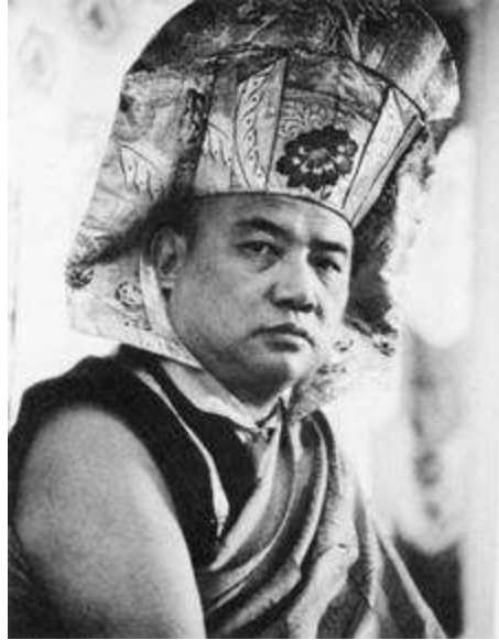
His Holiness the Sixteenth Gyalwa Karmapa.