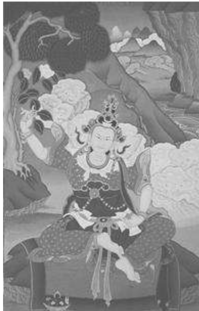
Dawa Sangpo, the first king of Shambhala.