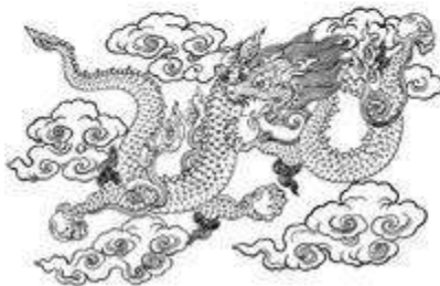
Tiger, lion, garuda, and dragon. LINE DRAWINGS BY SHERAP PALDEN BERU.

In order to help others, stay with the sadness. Stay with the sadness completely. Sadness is your first perception of somebody. Then you might feel anger, as the methodology to help them. You