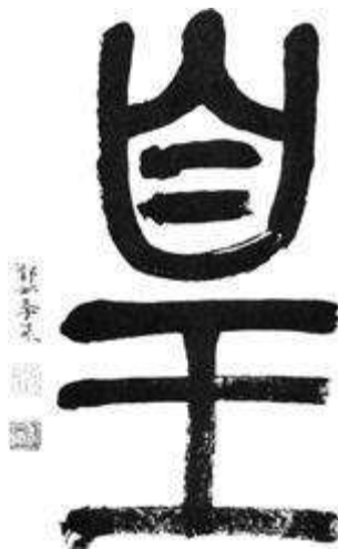
The Chinese character for emperor. The bottom half is the character for the ruler or king described in this chapter.

If we apply the perspective of heaven, earth, and man to the situation in the world today, we begin to see that there is a connection between the social and the natural, or environmental, problems that we are facing. When human beings lose their connection to nature, to heaven and earth, then they do not know how to nurture their environment or how to rule their world—which is saying the same thing. Human beings destroy their ecology at the same time that they destroy one another. From that perspective, healing our society goes hand in hand with healing our personal, elemental connection with the phenomenal world.