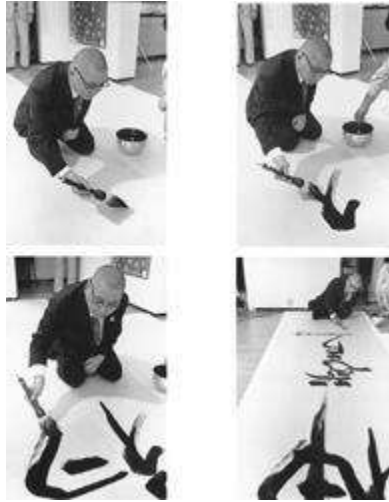
The author executing calligraphy of lungta, or windhorse.

thought, which arises from gentleness. You are not trying to fight with your world or to destroy anything, nor are you trying to gain anything personally. There is just the first flash, and then there is the sense of continuing that.