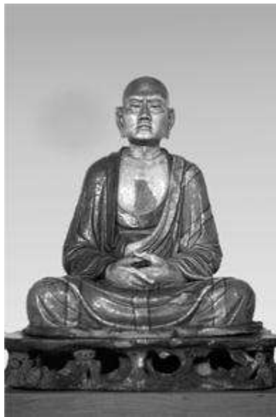
I-chou Lohan. This statue shows one of the disciples of the Buddha in the posture of meditation.

your gaze is directed slightly downward, maybe six feet in front of you. In that way, your vision does not wander here and there, but you have a further sense of deliberateness and definiteness. You can see this royal pose in some Egyptian and South American sculptures, as well as in Oriental statues. It is a universal posture, not limited to one culture or time.