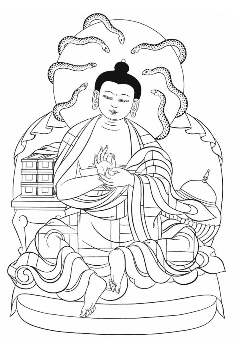
Nagarjuna (1st-2nd centuries A.D.)