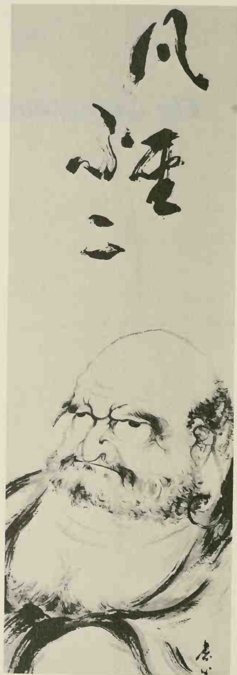
Contemporary brush painting of Bodhidharma by Eitara Tada.